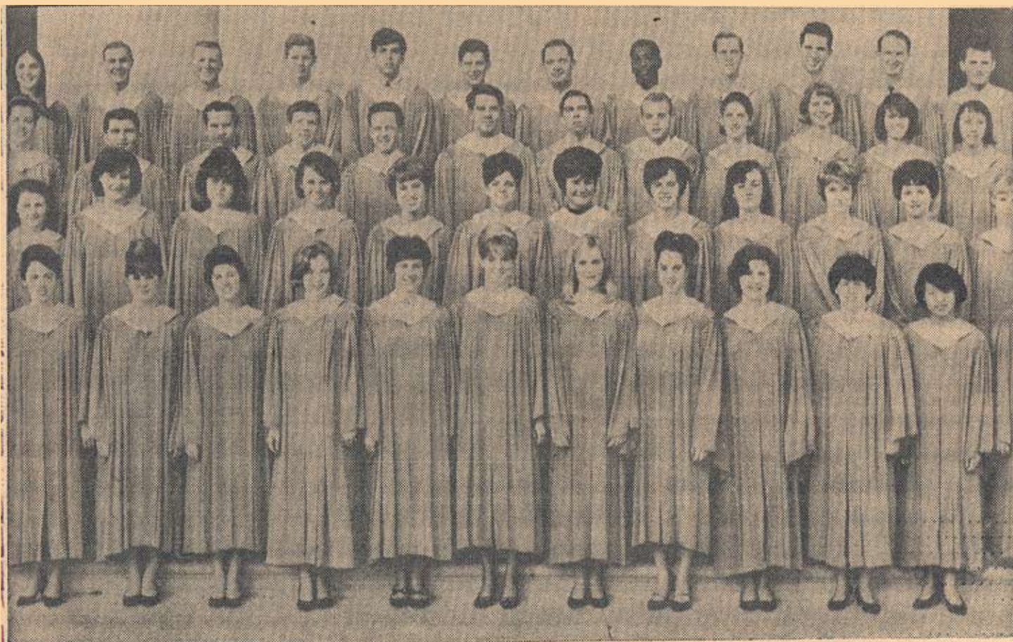
FORTY-FIVE male and female voices echoed through Ike's hallowed halls as Redlands University students presented their Winter Concert.

Diahn Wollemann remarks, (Continued on Page 2)